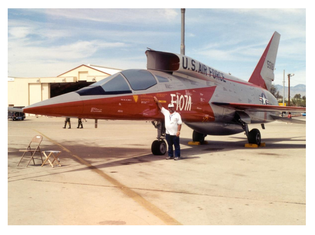
With his F-107A